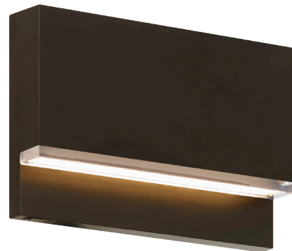
WEND OUTDOOR WALL/STEP LIGHT shown in bronze