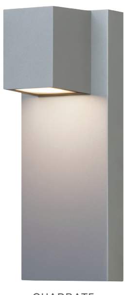
QUADRATE shown in silver