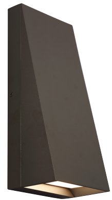
PITCH 12 shown in bronze