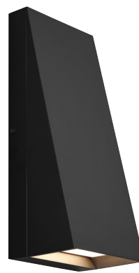
PITCH 12 shown in black

*Visit techlighting.com for specific warranty limitations and details.