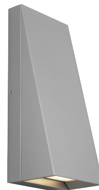
PITCH 12 shown in silver