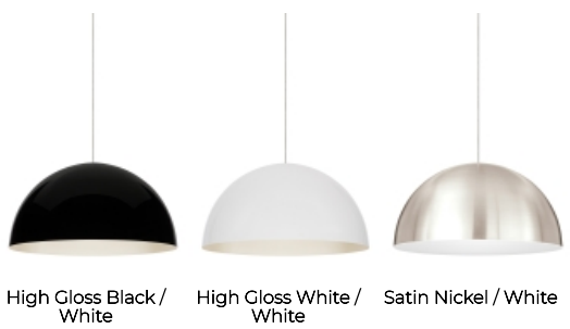
High Gloss Black / White

Includes 12 volt 6.6 watt, 300 delivered lumen, 3000K, integrated LED module. Dimmable with low-voltage electronic or magnetic dimmer (based on transformer). Includes 6 feet of field-cuttable satin cable.