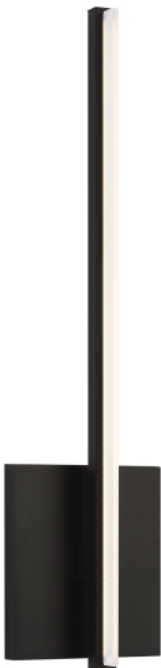
Matte Black Side View

120 volt 13 watt, 701 delivered lumens, 3000K LED module. Dimmable with most LED compatible ELV and TRIAC dimmers. 277V compatible with 0-10V dimmers. Mounts up or down