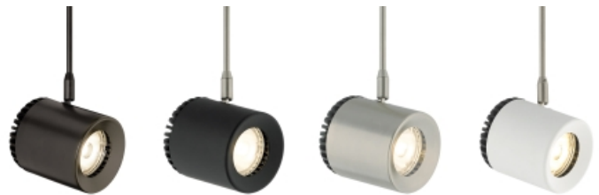
Antique Bronze / Antique Bronze