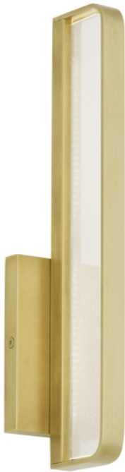
Natural Brass 3/4

Includes 11.7 watt, 348 delivered lumens, 3000K 90 CRI LED module. 120V dimmable with most LED compatible ELV and TRIAC Dimmers. 277V compatible with 0-10V dimmers. ADA compliant. Mounts vertical or horizontal. 120V or 277V.