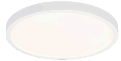
ROUND 12", WHITE