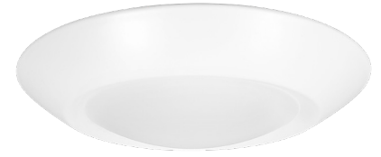
ROUND 6", WHITE