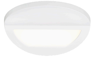
ROUND 5", WHITE