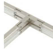
MonoRail T Connector