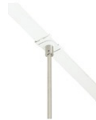
MonoRail T-Bar Connector

The T-bar clip twists into the slat. (Use only if local electrical codes allow). Specify 15/16" or 9/16" slat.