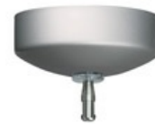
MonoRail Surface Transformer-75W Mag