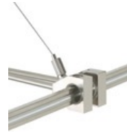
MonoRail Support Outside Rigger