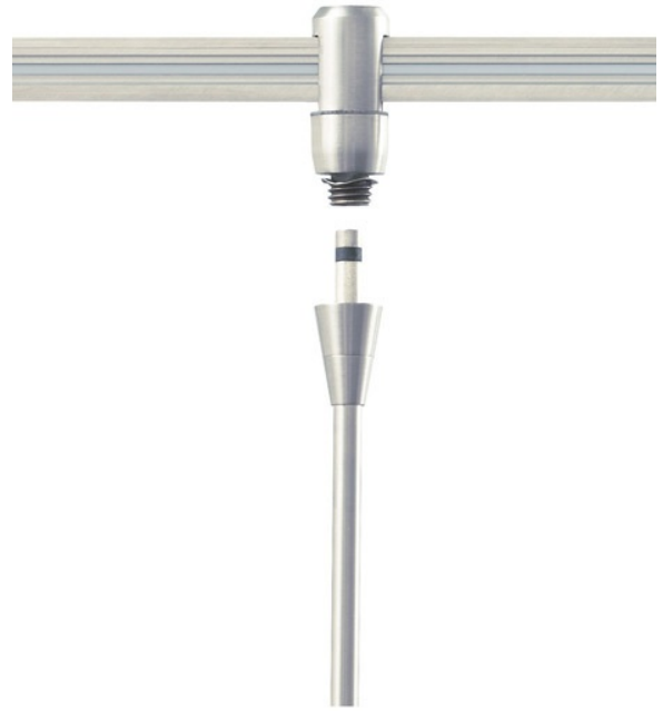
MonoRail FreeJack Connector