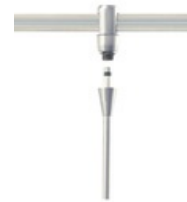
MonoRail FreeJack Connector