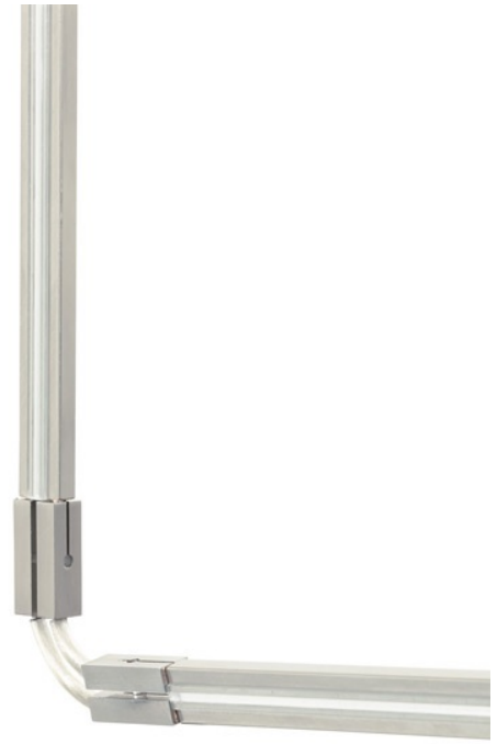
MonoRail Flexible Vertical Connectors