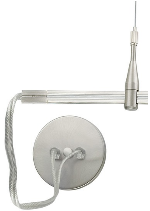
MonoRail End Power Feed

The end power feed pushes into an end of the MonoRail and includes a removable 4" round canopy and 12' of field-cutttable softwire leads.