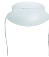
Kable Lite Surface Transformer-300W EL