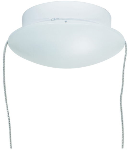
Kable Lite Surface Transformer-300W EL

It can power lamps totaling up to 300 watts. The transformer is concealed inside a decorative housing with a fast acting secondary circuit breaker that will safely turn the system off should a short occur. Once the short has been removed the unit can be reset by simply flipping the wall switch off and back on.