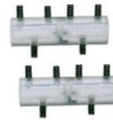
Kable Lite Isolating Connectors