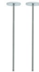
Kable Lite Heavy Duty Standoffs