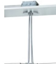
Kable Lite 4" Round Power Feed Canopy Dual-Feed